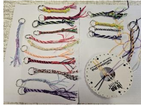
The results of our efforts

Next month we are making an origami bird.