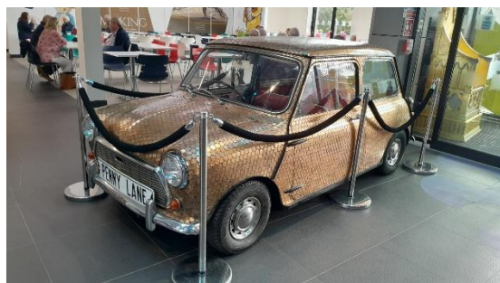
Mini Car covered in old 1d pieces in the foyer

53 of our members (49 by coach and 4 by car) visited the visit Royal Mint at Llantrisant. The visit was very interesting, informative, mysterious, secretive but not very interactive. The Royal Mint has a long history. The first coins were minted in London in about 650 AD, with the Mint formally established in the reign of Alfred the Great in 886 AD. In 1270 AD minting was consolidated in the Tower of London. In 1696 AD, Sir Isaac Newton took control of the Mint. By 1805, the cramped site was moved to a specially designed site on Tower Hill.