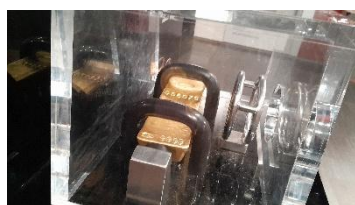
Gold Bullion bar in the Display and History Exhibition – extremely heavy!

The next point of call was the personal coin making press. Several of our group pressed their own coin, again under a 600 tonnes press.